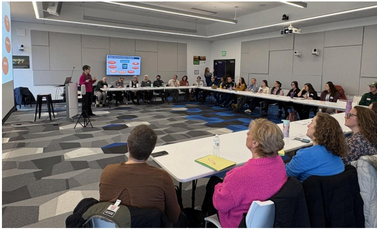
A recent convening brought together over 45 community navigators and coordinators to learn more about food insecurity in the county and how to help.

By hosting dedicated convening spaces, BUW helps educators, navigators, and leaders deepen their knowledge, expand referral networks, and enhance their ability to guide residents toward the right resources at the right time. This collaborative approach ultimately leads to stronger outcomes for families across the county.